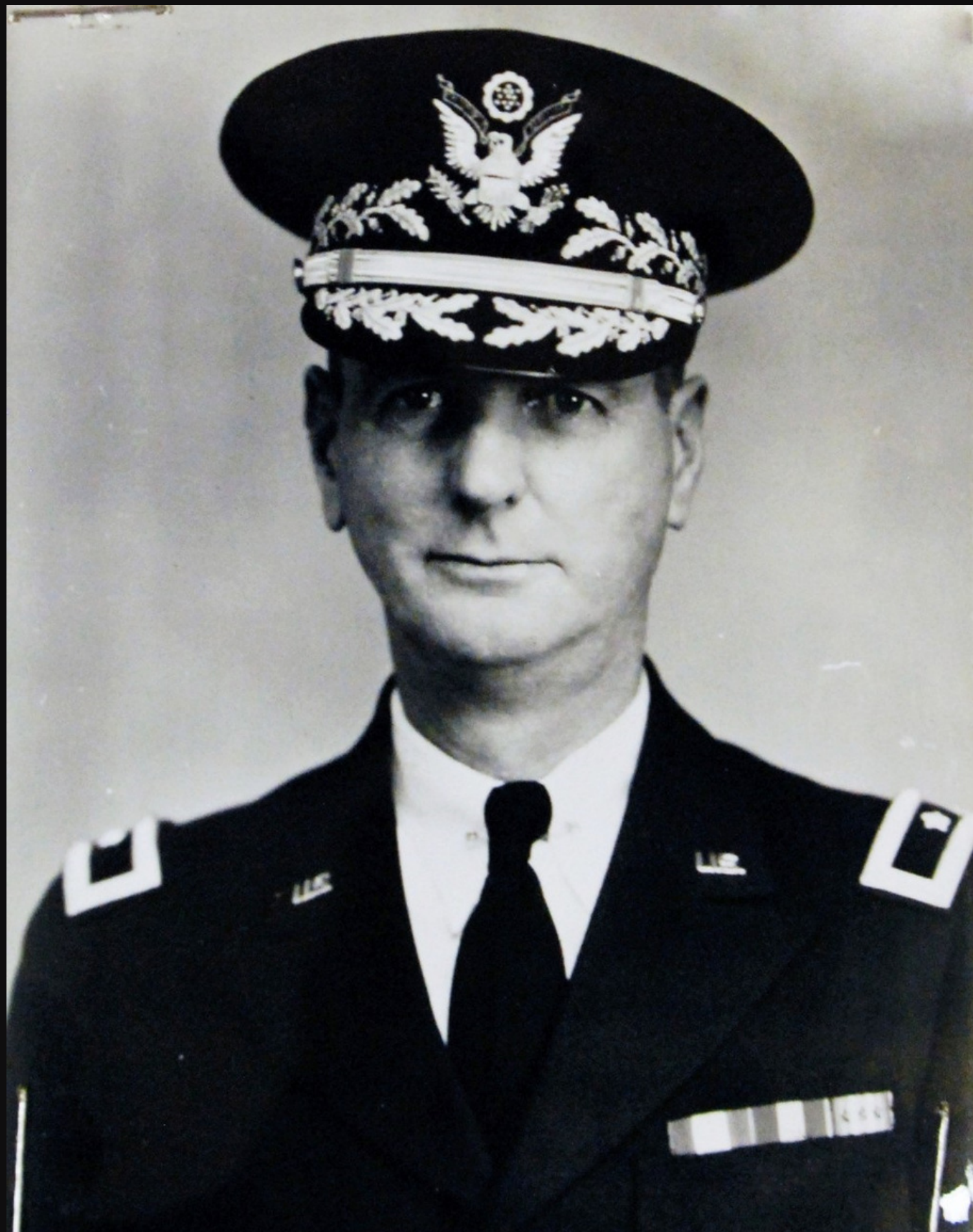
General Jonathan Wainwright