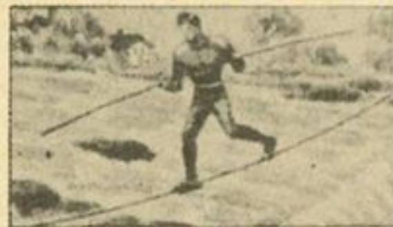
Mr. Blondin practising

Charles Blondin, acrobat, today performed the incredible stunt of crossing the Niagara Falls on a tightrope high over the water, balancing precariously on stilts. He made several trips across, one of them while blindfolded, pushing a